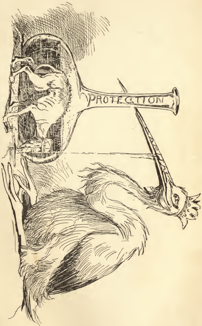
"I AM FOR PROTECTION!"